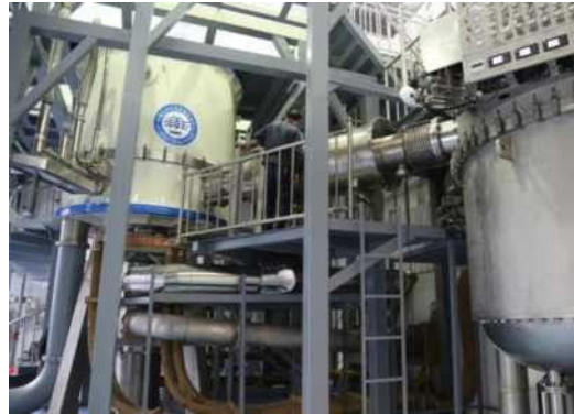
The Hefei steady-state strong magnetic field device achieved a 400,000 Gaussian steady-state strong magnetic field

CASHIPS has over 20 well-equipped national, provincial, and CAS key laboratories and research centers, including the national major project Experimental Advanced Superconducting Tokamak (EAST) experimental nuclear fusion device, the national major science project steady-state strong magnetic field device, the Key Laboratory of Atmospheric Optics for the National 863 Program, the Intelligent Robot Sensing Technology Laboratory for the National 863 Program, the National Environmental Optical Monitoring Instrument Engineering Center, the Key Laboratory of Environmental Optical Monitoring Technology of the Ministry of Environmental Protection, the CAS-National Ethnic Affairs Commission Agricultural Information Technology Joint Laboratory, the CAS Key Laboratory of Ion Beam Bioengineering, the CAS Key Laboratory of Environmental Optical Monitoring, the CAS Key Laboratory of Materials Physics, the CAS Key Laboratory of General Optical Calibration and Characterization, the CAS Key Laboratory of Atmospheric Composition and Optical Radiation, the CAS Key Laboratory of Novel Thin Film Solar Cells, the Anhui Provincial Nanomaterial Engineering and Research Center, the Anhui Provincial Key Laboratory of Photonic Devices and Materials, and the Applied Technology Research Center for Low Temperature Superconducting Magnets and Electricity Energy Saving.