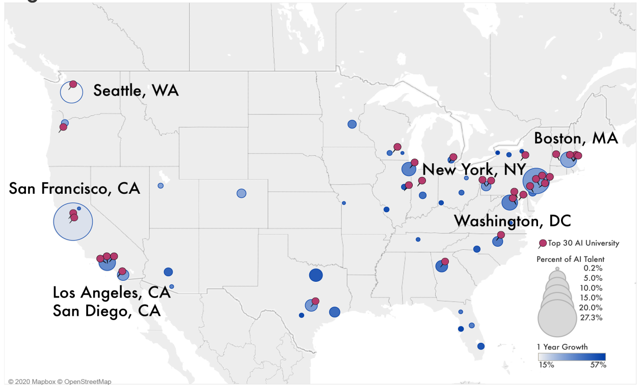
Figure 1. Industrial Talent and Talent Growth

With the increasing importance of artificial intelligence and the competition for AI talent, it is essential to understand the U.S. domestic industrial AI landscape. To this end, we mapped where AI talent is produced, where it concentrates, and where AI equity funding goes. This mapping shows distinct AI hubs emerging across the country, with different growth rates, investment levels, and potential access to talent. Talent production, talent employment, and investment are not fully aligned, possibly informing the talent shortage in Silicon Valley and highlighting the opportunity for innovative hubs to develop throughout the nation. The mapping also reveals that, while investment is split along the West and East Coasts, Chinese investment—though modest overall—is concentrated in Silicon Valley.